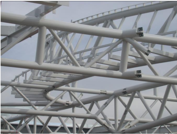
Glen Eira Trusses